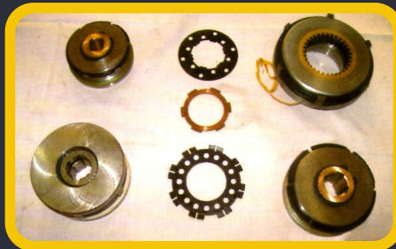
Clutch & Clutch Plates