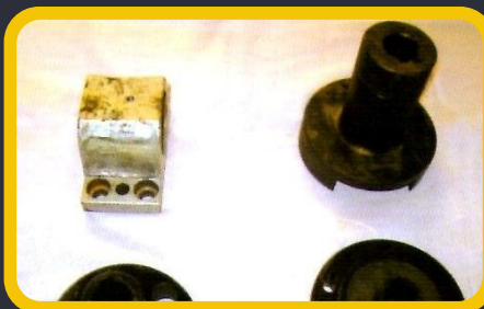
Couplings & Brackets