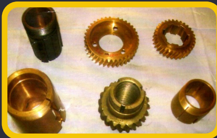
Worm Nut & Bushes