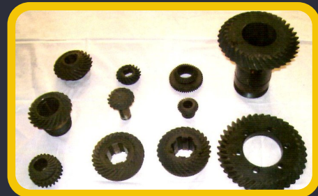
Spiral Bevel Gears