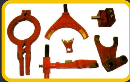
Levers & Plunger Pump