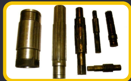
Spline Pinion & Clutch Shafts